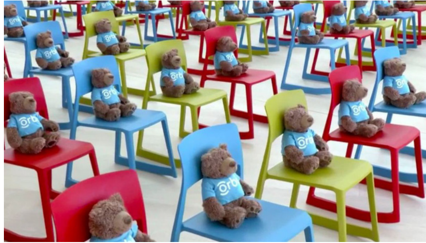
Teddy bears at the Swatch press conference