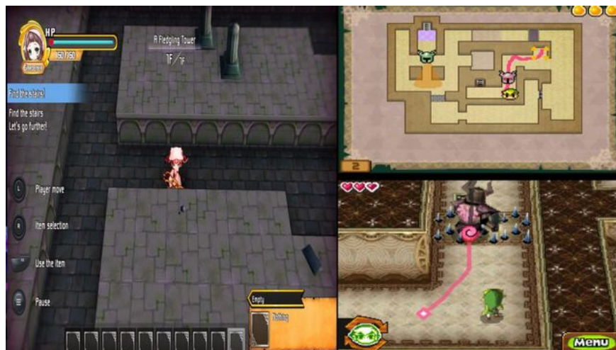
Tower of the Approval (left) and Legend of Zelda (right)

The game has a Manga style, so bright graphics are indispensable, there are 5 Maps for gamers to choose without fear of being bored. Certainly the familiar design like the labyrinth of Tower of the Approval has reminded some people of the graphics and images of the blockbuster once - Legend of Zelda.