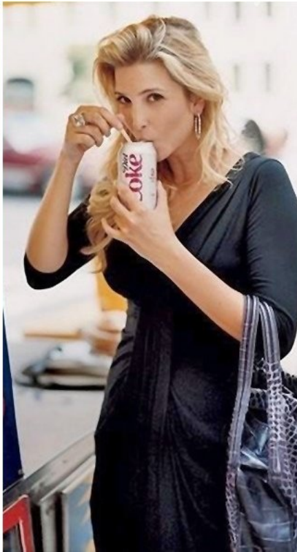
1. Age : 35