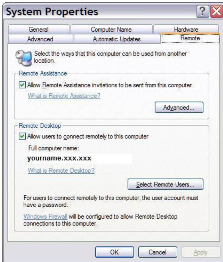
Figure A: Remote Card (System Properties)