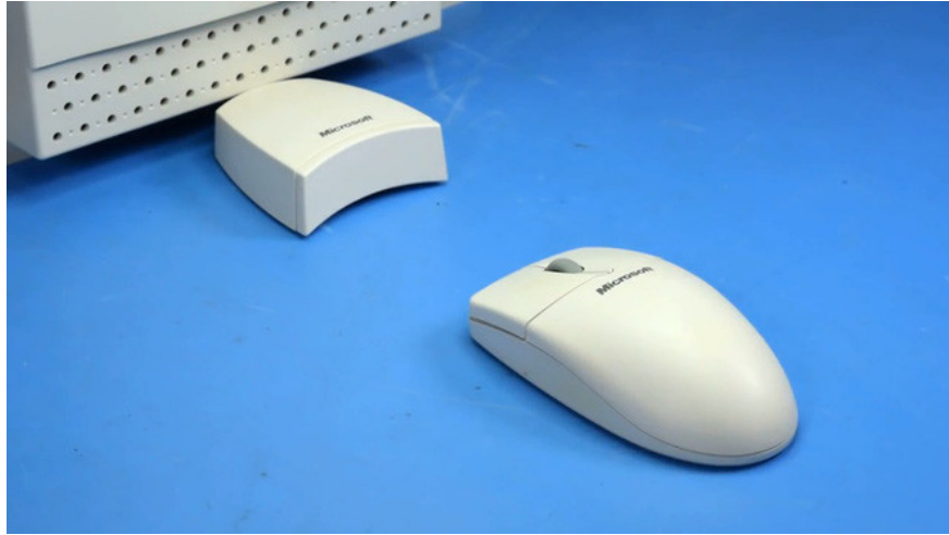
Windows 98 Second Edition.