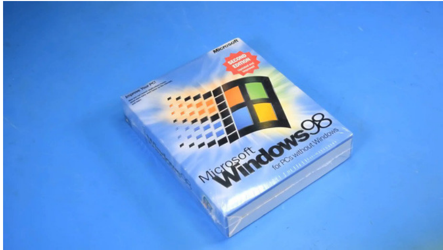
Floppy drives and CD drives are pretty much used at that time.