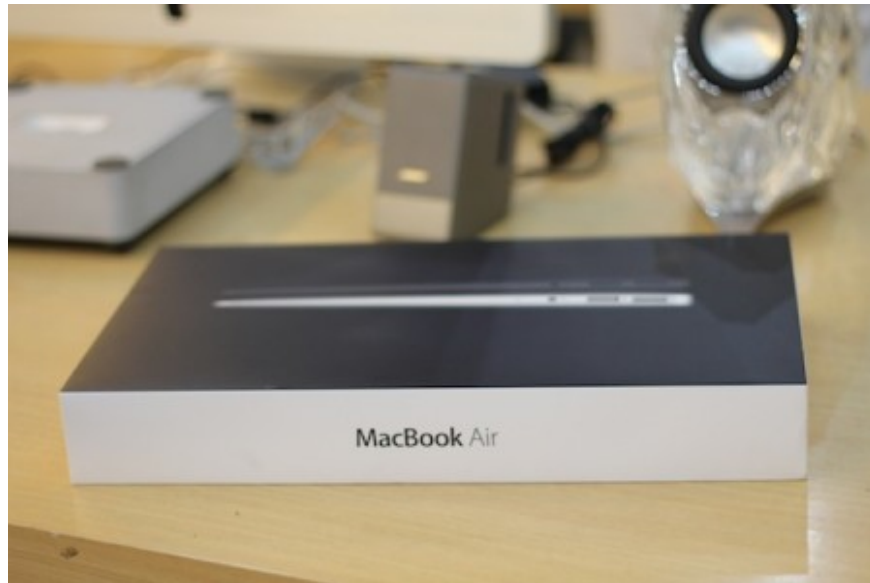
Box of MacBook Air 11.6 inches.