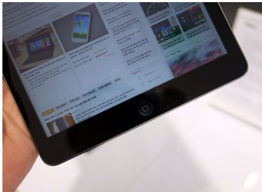
It uses the Home key instead of the fingerprint recognition as on the iPhone 5S .