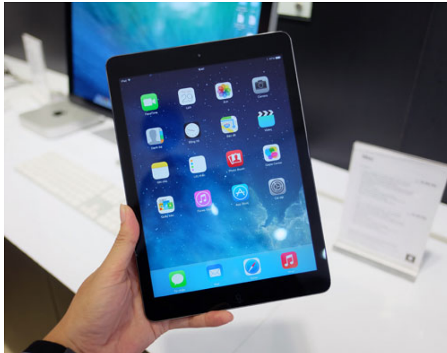
iPad Air preinstalled iOS 7 operating system. See more genuine iPad Air photos in Vietnam