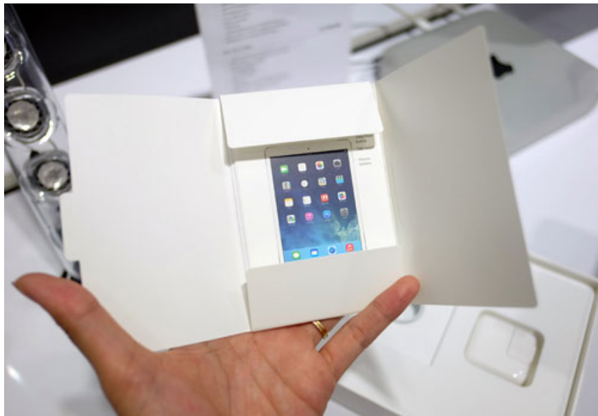
The manual and no sim sticks due to the version only has Wi-Fi connection.