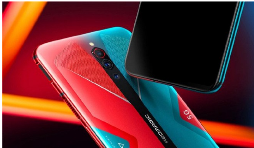
Cyber ??Neon color version

In addition, the screen of the device is also integrated the fingerprint sensor below, TÜV Rheinland certified with the ability to produce less harmful blue light for the eyes than conventional AMOLED screens.