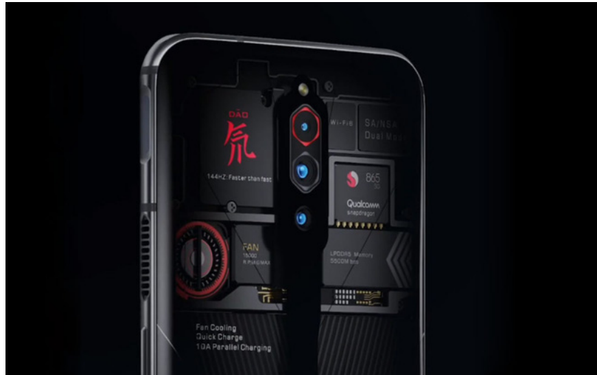
Nubia Red Magic 5G transparent back