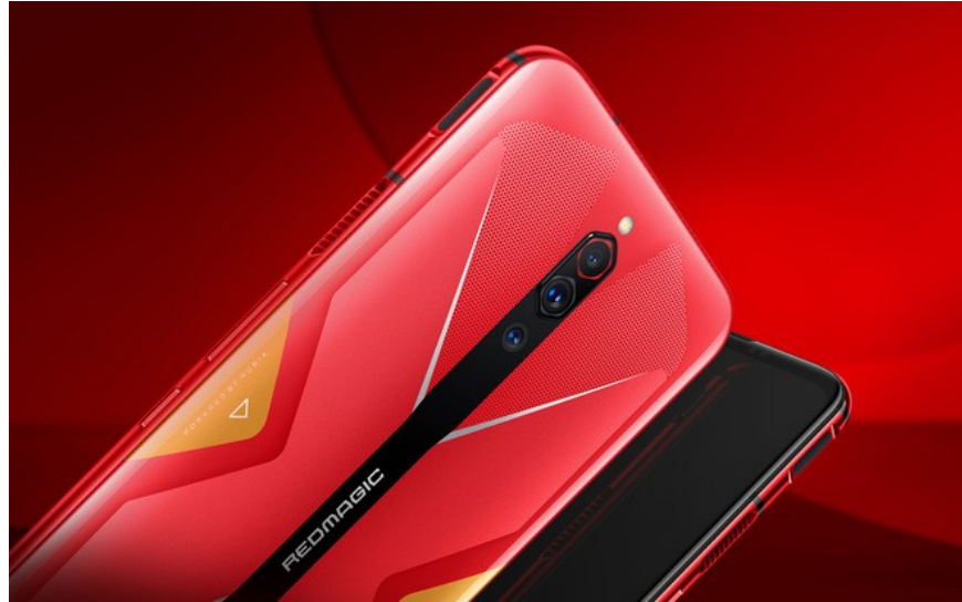
Mars Red (Mars Red)

Besides, thanks to the 340Hz touch sampling screen, this phone can completely bring the best gaming experience to users. According to Nubia, the Red Magic 5G's high frequency scan screen is not only limited to gaming but also works with dozens of other applications such as browsers, messaging applications or social networking applications .