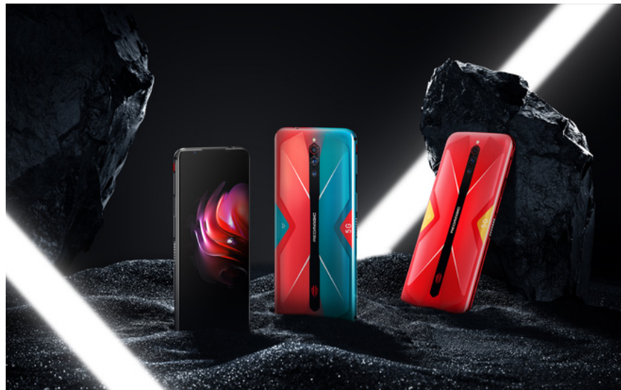
Nubia Red Magic 5G

Today (March 13), Nubia has just launched its latest gaming smartphone in China, called Red Magic 5G. In addition to beautiful design, this phone is also equipped with extremely impressive specifications, especially the brand new radiator fan system.