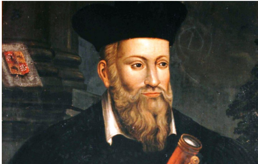
Portrait of prophet Nostradamus

Nostradamus - The world-famous prophet with the ability to accurately predict events in human history. His predictions of the future about the future are based on the calculations of planets and stars with the earth.