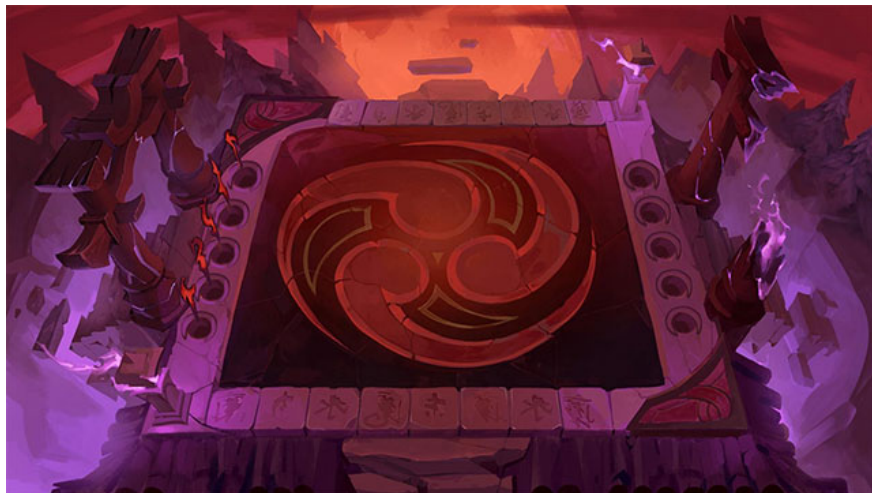
The Blood Moon arena has a logo that resembles the "Sharingan" in the middle.