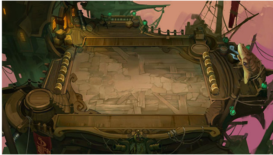
The ring represents the Bilgewater region in the form of a pirate ship.