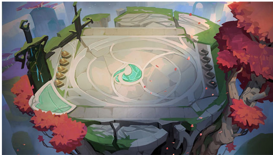
The arena represents the Ionia region.