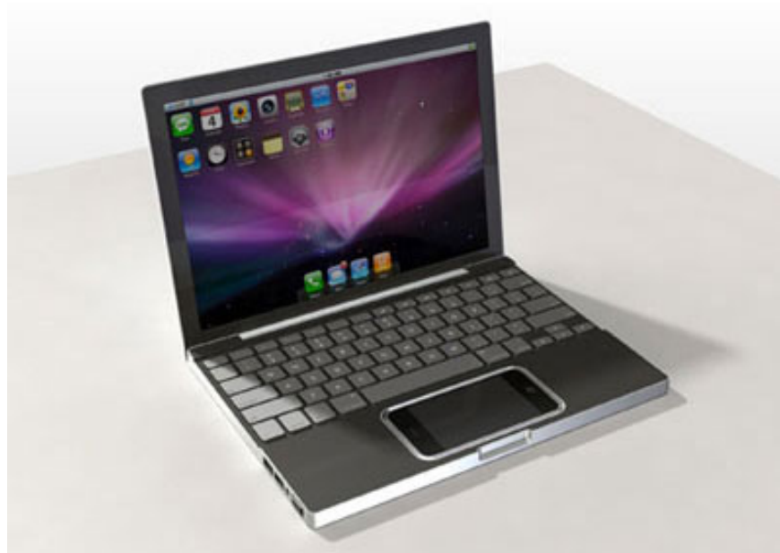
Image of Apple netbook simulation. Although Steve Jobs insists that Apple does not need to produce netbooks, analysts still believe it will probably change next year.

It would be lame to compare netbooks to the iPhone, because while the netbook is a computer, the iPhone is Apple's famous touch phone. Consumers look to netbooks to meet basic computing needs such as surfing the web or doing office tasks. In contrast, iPhone customers want to own a device that can make calls, send messages, surf the web, email and own some other multimedia entertainment features.