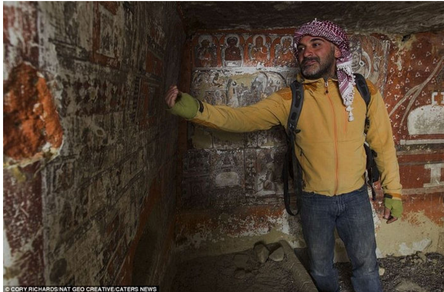
The carvings of Buddhism in a cave.