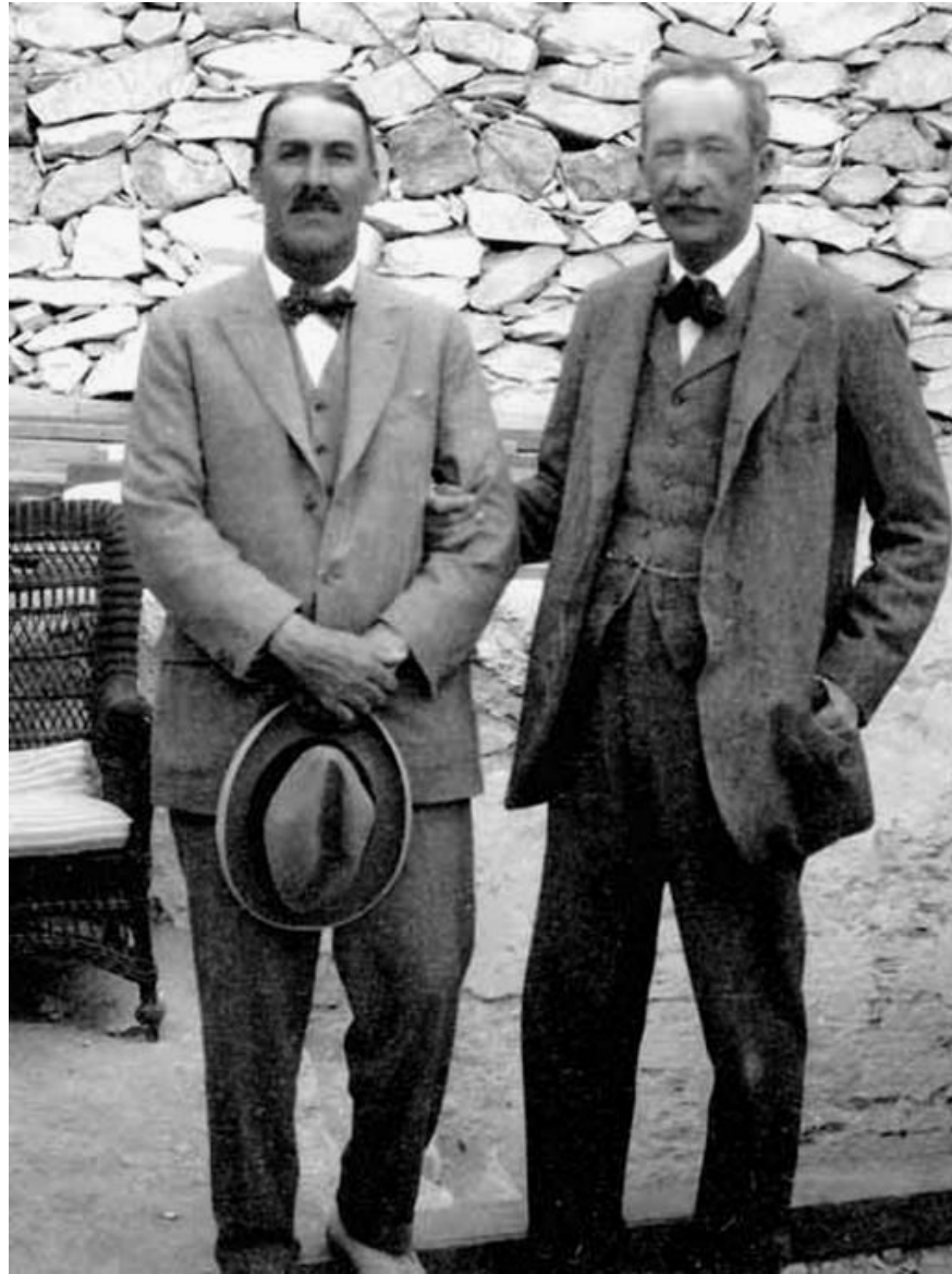
Howard Carter (left) and Count Carnarvon (Right) stand in front of the tomb.