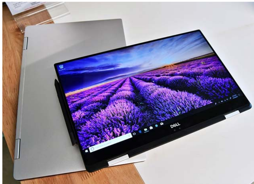
The current Windows 10 tablet interface on 2 in 1 devices

In addition to the tablet experience changes, Microsoft is currently testing a cloud download option to support the ability to reinstall and restore Windows 10 PCs. It is similar to another feature that has appeared on Windows. macOS for many years as well as some Surface devices. This option will allow Windows users to quickly reinstall the operating system without installing it on a local hard drive or USB.