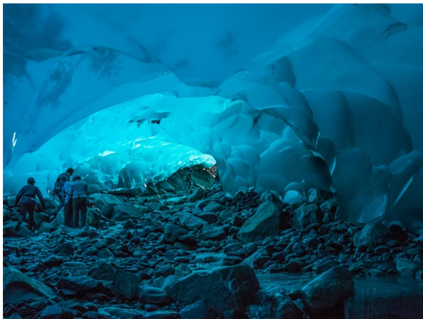
As part of the Mendenhall Glacier glacier, Mendenhall ice caves formed by melting glaciers create a mysterious, beautiful turquoise world.