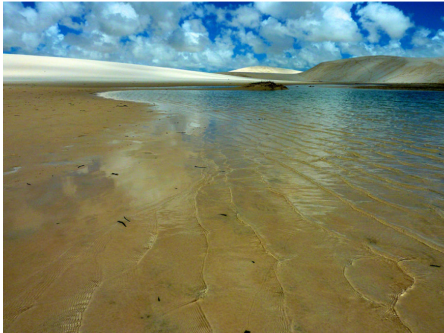
White sand dunes in Lencois Maranhenses National Park, Brazil looks like a desert.