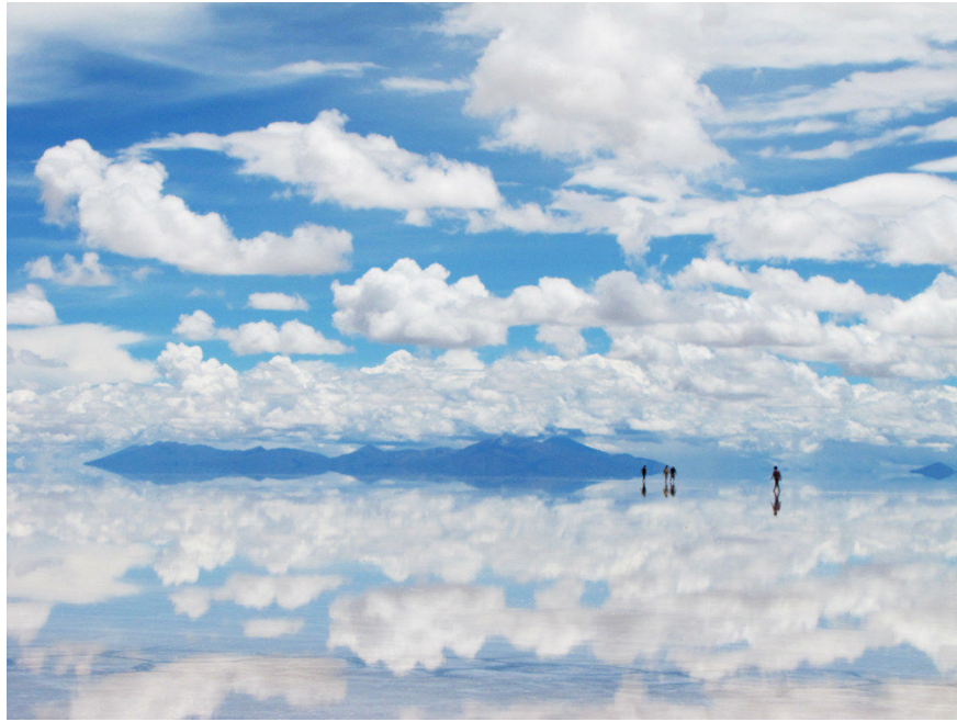
Salar de Uyuni is the largest salt lake in Bolivia as a mirror reflecting the vast sky.