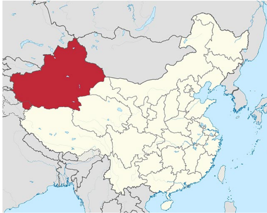
Location of Xinjiang (red area)

Xinjiang is a large and resource-rich autonomous region in western China, which is an ancient land of more than 8 million Uighurs - a Muslim Muslim nation and has many dissenting views with the government. Beijing for decades. The increasingly fierce conflict between the Chinese government and a few ethnic minorities in the past few years has caused the region to suffer from extremely tough management measures such as the deployment of identity systems. Dense face, applications that facilitate monitoring and curfew are almost continuous.