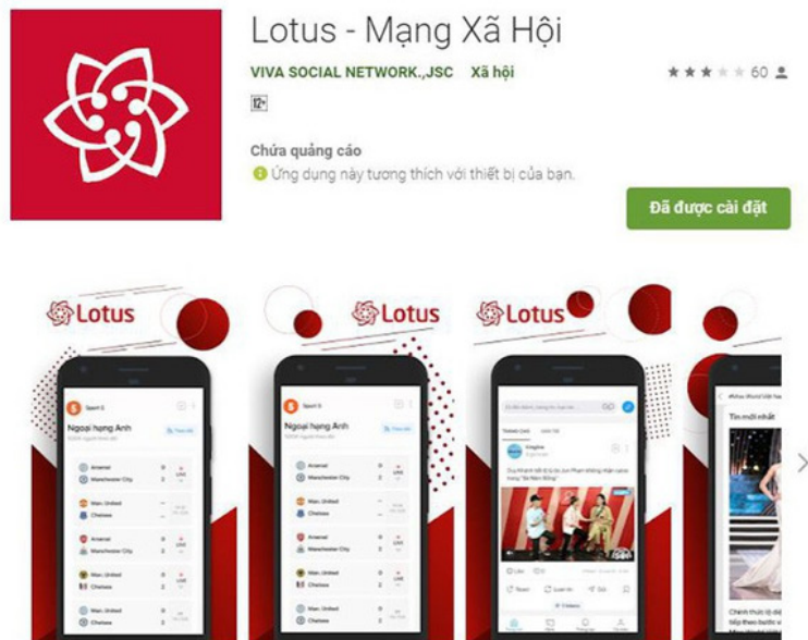
Lotus là mạng xã hội do người Việt phát triển, lấy nội dung và trải nghiệm người dùng làm trọng tâm.