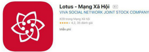
Ảnh chụp màn hình iPhone