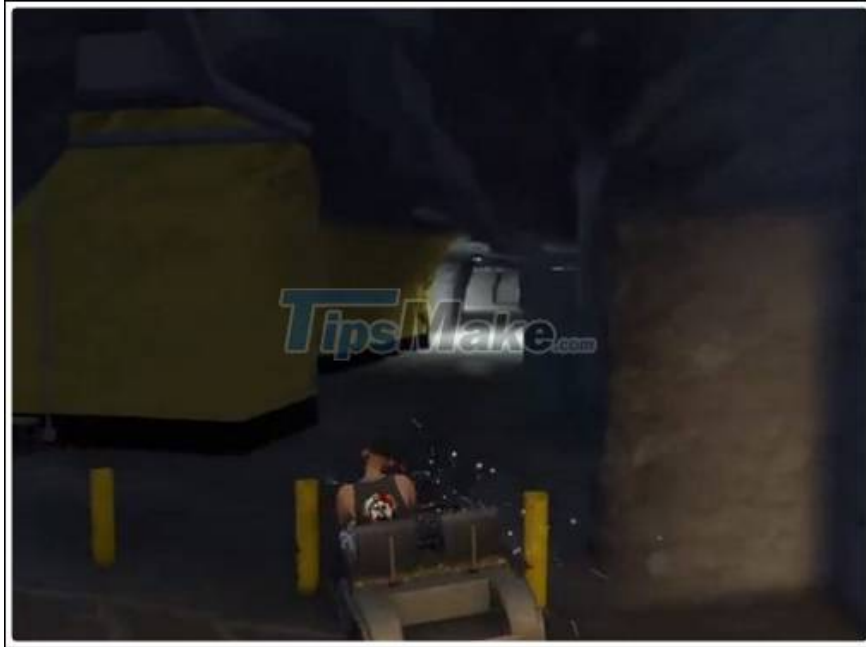
Thomson Scrapyard Bunker (2,290,000 USD): Northeast of Thomson scrapyard in Grand Senora Desert.