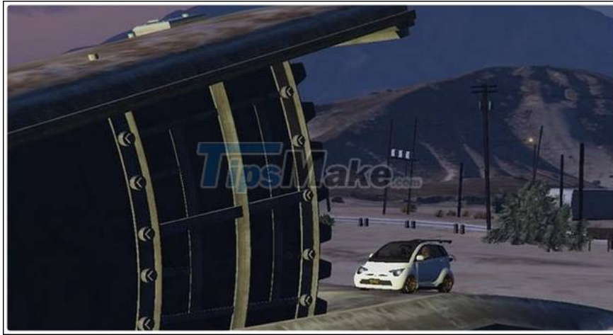
Paleto Forest Bunker ($ 1,165,000): Found west of the Procopio Promenade as you approach Paleto Cove.