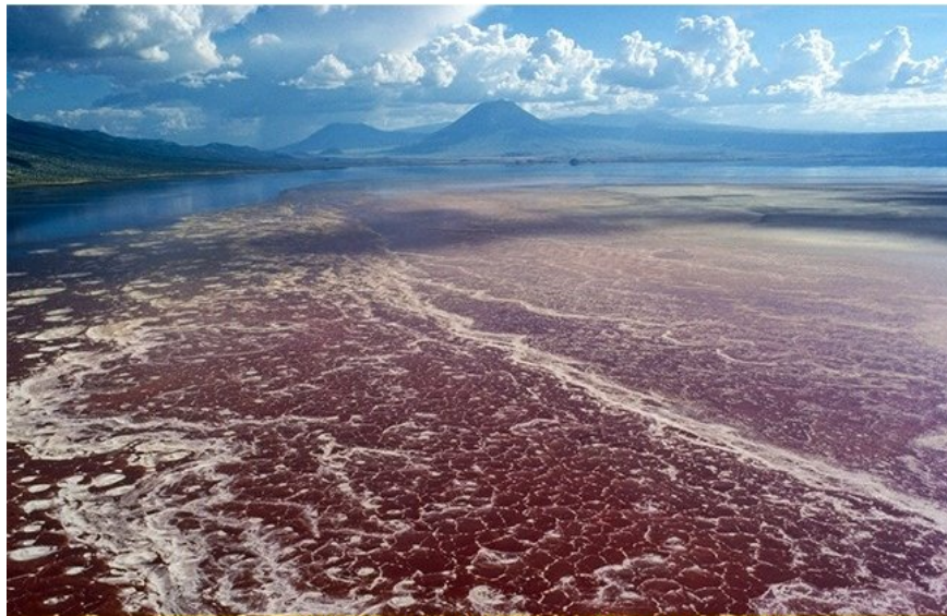
SALT CRUST ON NATRON'S SURFACE