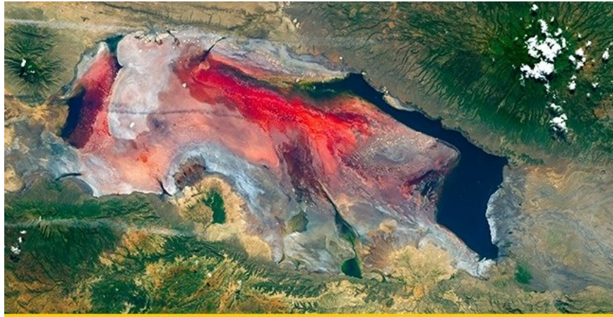
NATRON SATELLITE VIEW