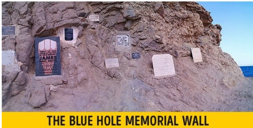
THE BLUE HOLE MEMORIAL WALL