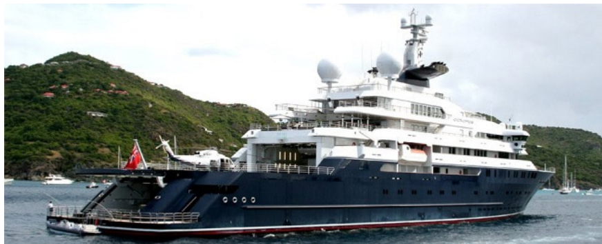
In addition, he owns many properties including a private island, two large yachts and a museum specializing in science fiction.