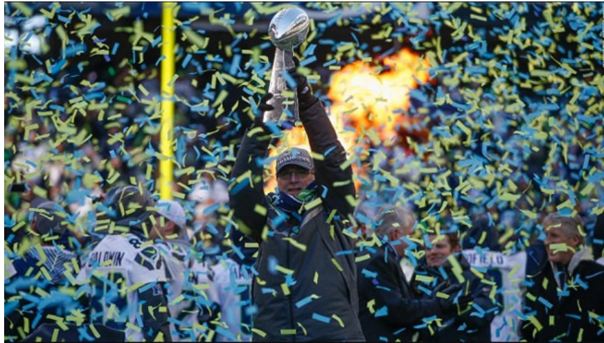
In the picture, Paul Allen is lifting the Seattle Seahawks trophy won in 2014.