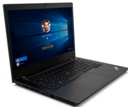
Lenovo ThinkPad L14

The ThinkPad L14 and L15 are the latest L-series products. There will still be new generation options for Comet Lake vPro or Ryzen PRO 4000 processors, along with support for Wi-Fi 6, Cat 16 LTE, Windows Hello and Privacy Guard .