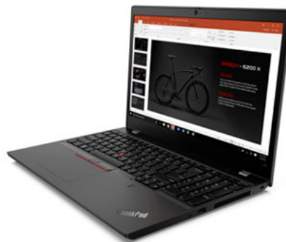
Lenovo ThinkPad L15

The ThinkPad L14 is priced at $ 649 for the lowest version, while the L15 will start at $ 649.