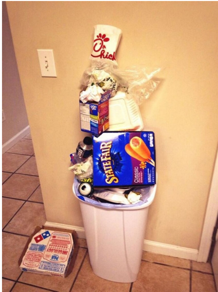
Garbage for a long time does not go down, is about to become a high mountain, it looks beautiful too.