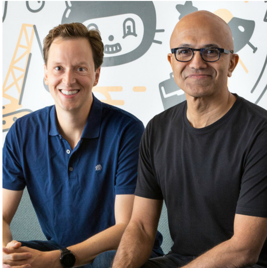
Nat Friedman, CEO of GitHub (left) and Satya Nadella, CEO of Microsoft.

Previously, this ridiculous event once appeared in Microsoft history, it even has its own name. And last Thursday, thousands of Microsoft employees were caught up in the event, after 22 years. Specifically, they are constantly spammed by all sorts of miscellaneous, receiving all feedback mail in the spam mail chain. This is an email whirlpool that does not stop and cannot escape.