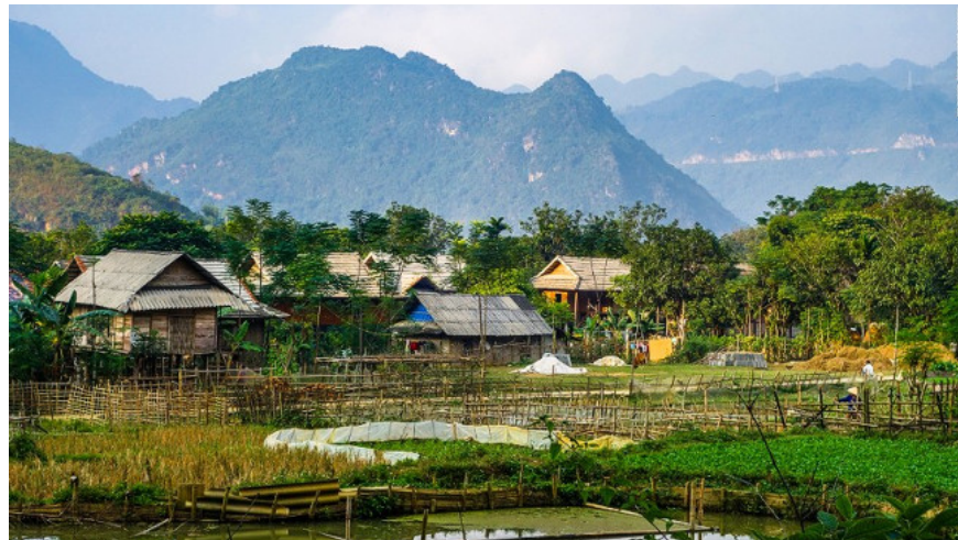
Rural in Mai Chau The peaceful village scene in Mai Chau and Hoa Binh.

With a rural, peaceful and peaceful lifestyle, Mai Chau is the first stop to be glamorous to welcome visitors on the northern road before continuing on to the terraced rice fields in Nghia Lo, Than Uyen and Sapa . The place has the highest mountain of the country and is also the gateway to the Hoang Lien Son mountain gate, for many years Sapa is a tourist destination attracting many tourists.