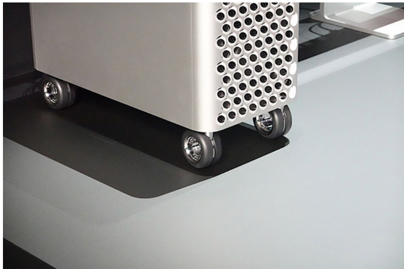
Mac Pro Wheel Brackets

The Mac Pro with the above configuration will cost about $ 50,000. Not to mention the extra screen set as mentioned above, AppleCare + or the installation of software like Final Cut Pro X. The cost of all these