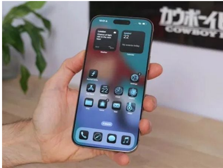
Unique App Icons and Customizations on iPhone 16 Pro/Pro Max