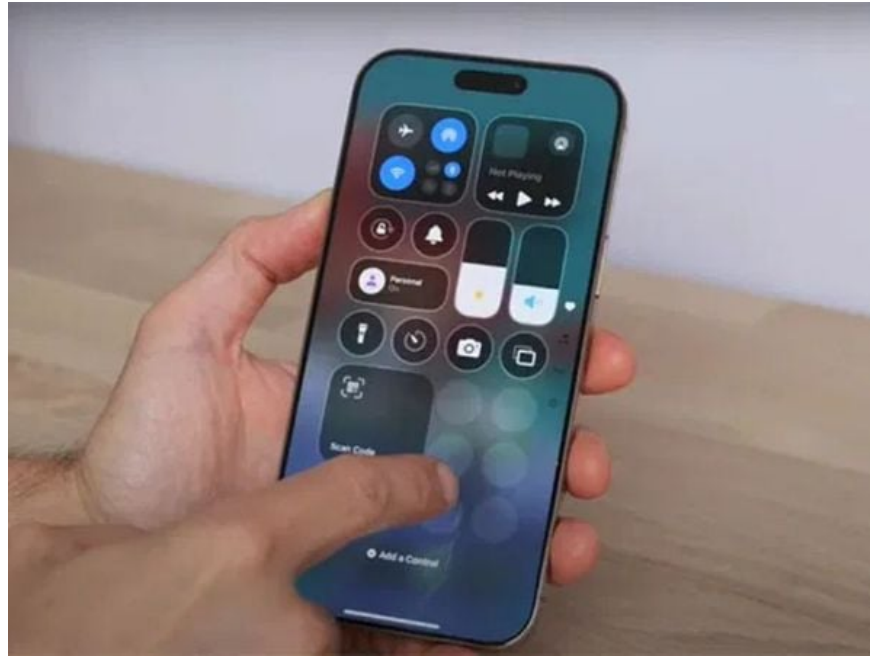
Customize the Convenient Control Center on iPhone 16 Pro/Pro Max