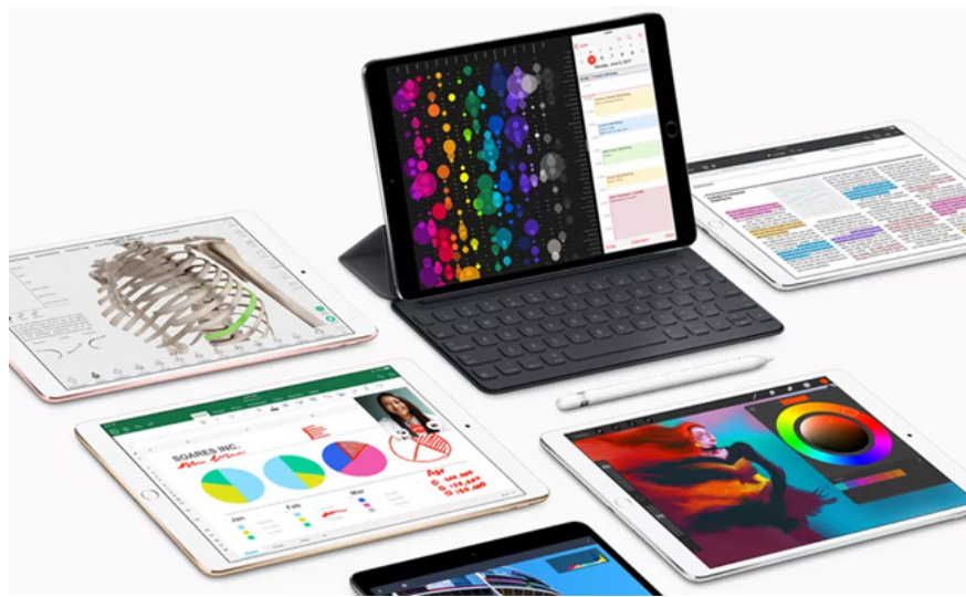
Image of 10.5-inch iPad Pro running iOS 11 published at WWDC 2017

iPad has never been a true computer. When launched in 2010, it was ridiculed for having a big screen without a typical large-screen operating system like macOS or Windows, and it was treated as a size iPhone. great. However, this "extended iPhone" also has a lot of really interesting applications, and even though iPad sales have slowed in recent years, Apple's tablet still proved to be buoyant. language as well as its position. At WWDC 2017, Apple emphasizes bringing the iPad to its next-generation computer platform, and this has made the tech community excited.