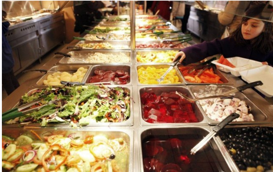
A little girl eating her own buffet at a fast food restaurant in Harlem, New York. Regarding agriculture: " Ingredients from agriculture, especially animal products, are often wasteful and ineffective. "