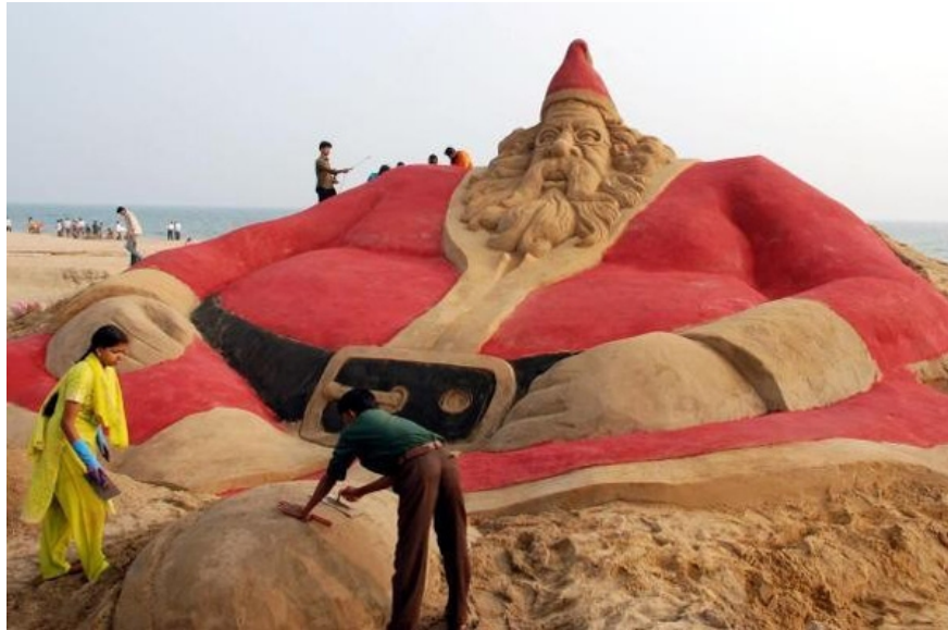
The world's largest sand Santa is over 30 meters long, 9 meters wider at Puri Beach, India, built from over 1,000 tons of sand.