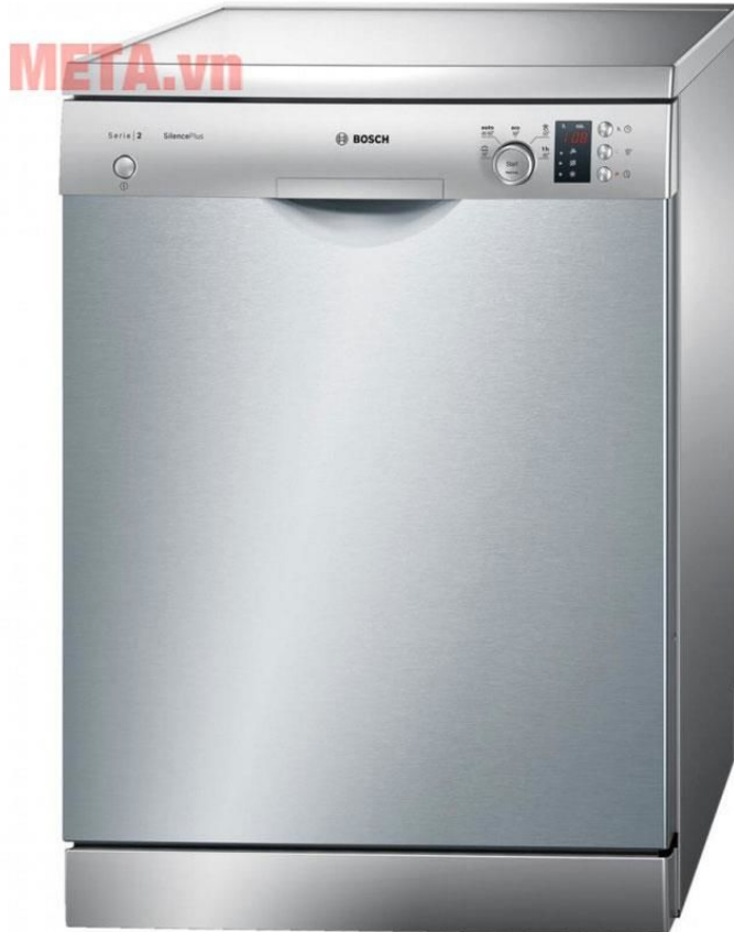
Dishwasher Bosch SMS25KI00E