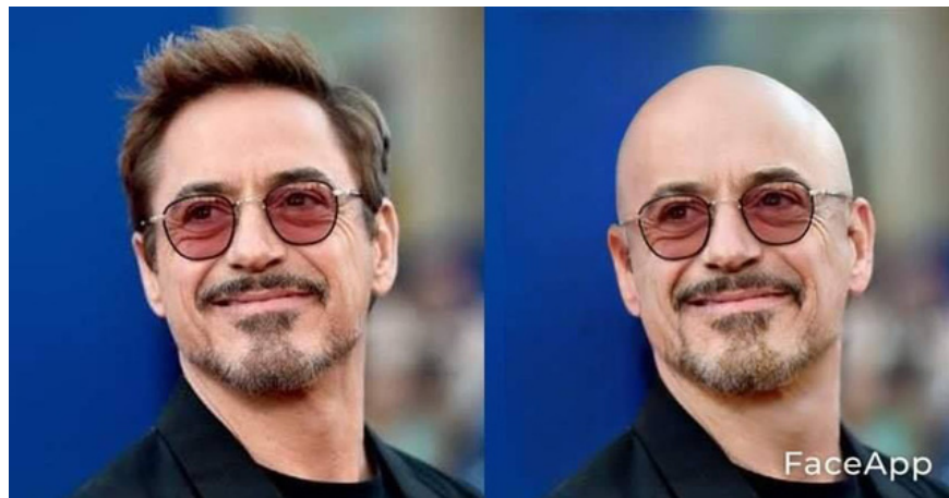
Robert Downey Jr.