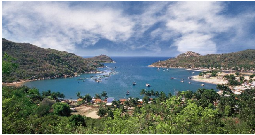
Pristine natural scenery of Ninh Thuan

Ninh Thuan is famous for Hang Rai beach where there are waves rushing into the rock to remove white foam. The natural scenery here is likened to a depressing, wild picture mixed with a bit of mystery due to the bizarre coral reefs, huge rocks covered by moss-colored time.