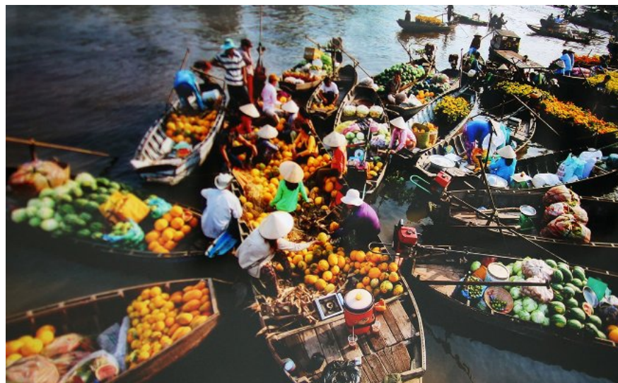
Bustling floating market in the West

The highlight of the West is the garden of immense fruits, full of fruits such as: orange, tangerine, durian, coconut, guava, na, apple, jackfruit, mango, rambutan . Here, you don't should ignore the famous gardens such as Cai Mon (Ben Tre), Cai Be, Vinh Kim (Tien Giang), My Khanh (Can Tho) .