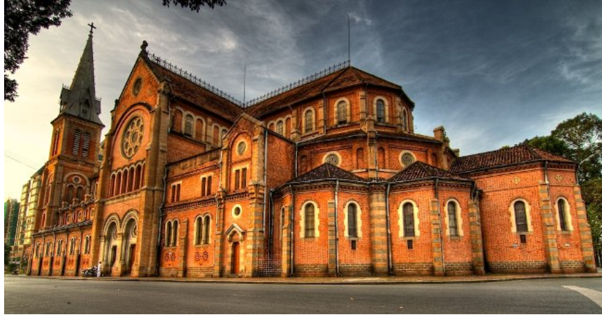
Ancient Notre Dame Cathedral in Saigon

Many couples choose Saigon as their honeymoon place because of the rich and diverse cuisine here. Saigon has bustling culinary streets with a full range of dishes from rustic to luxurious, from snacks to full stomachs, from Vietnamese cuisine to international cuisine and especially everything at all prices. Very cheap so you can save a lot of money in your trip.