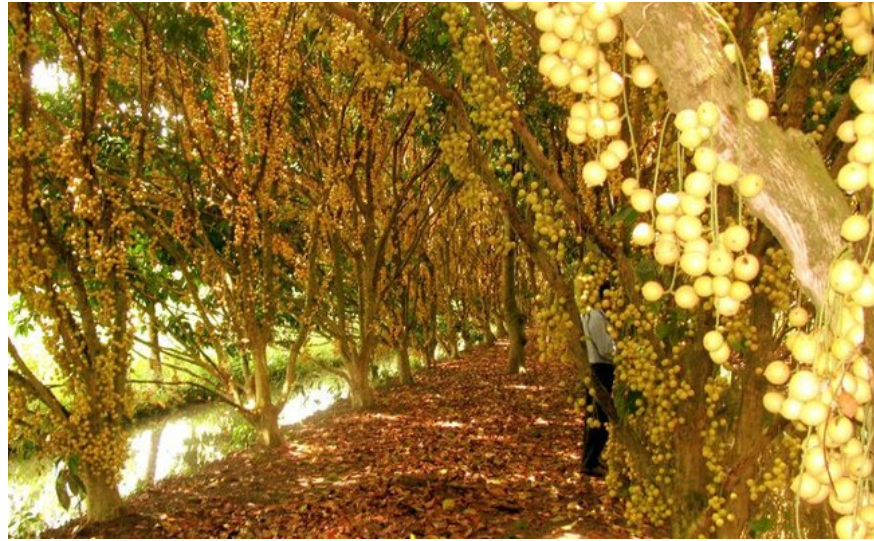
Exhausted fruit garden in the West

The highlight of the West is the garden of immense fruits, full of fruits such as: orange, tangerine, durian, coconut, guava, na, apple, jackfruit, mango, rambutan . Here, you don't should ignore the famous gardens such as Cai Mon (Ben Tre), Cai Be, Vinh Kim (Tien Giang), My Khanh (Can Tho) .