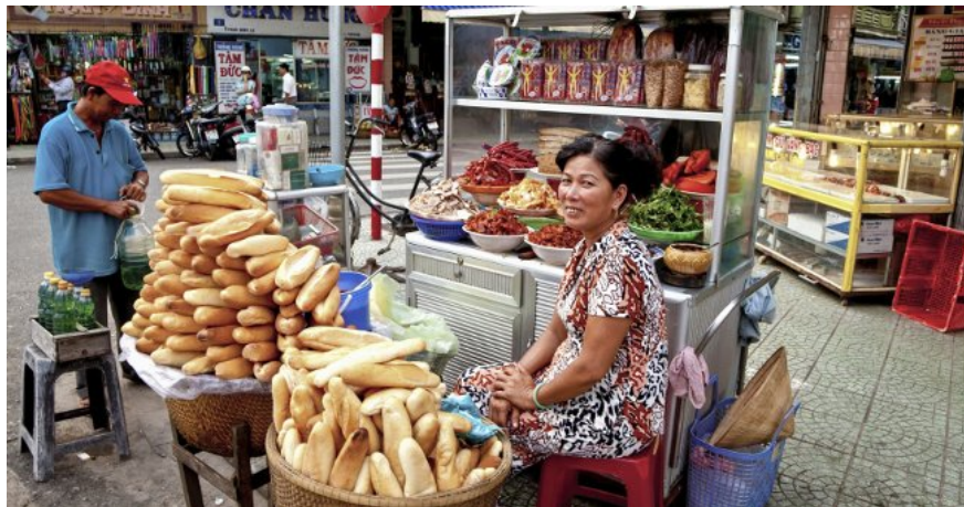
A Saigon bakery shop in foreign newspapers

Many couples choose Saigon as their honeymoon place because of the rich and diverse cuisine here. Saigon has bustling culinary streets with a full range of dishes from rustic to luxurious, from snacks to full stomachs, from Vietnamese cuisine to international cuisine and especially everything at all prices. Very cheap so you can save a lot of money in your trip.