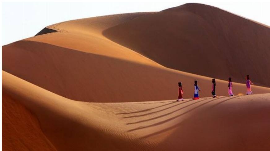
Wild sand hill in Ninh Thuan

Ninh Thuan is famous for Hang Rai beach where there are waves rushing into the rock to remove white foam. The natural scenery here is likened to a depressing, wild picture mixed with a bit of mystery due to the bizarre coral reefs, huge rocks covered by moss-colored time.