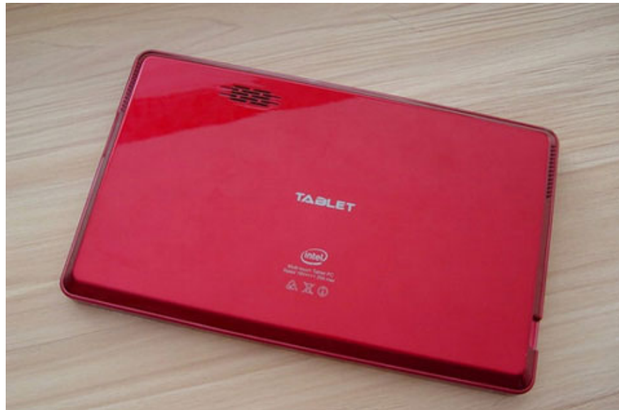
Back of the phone with logo and speakers.