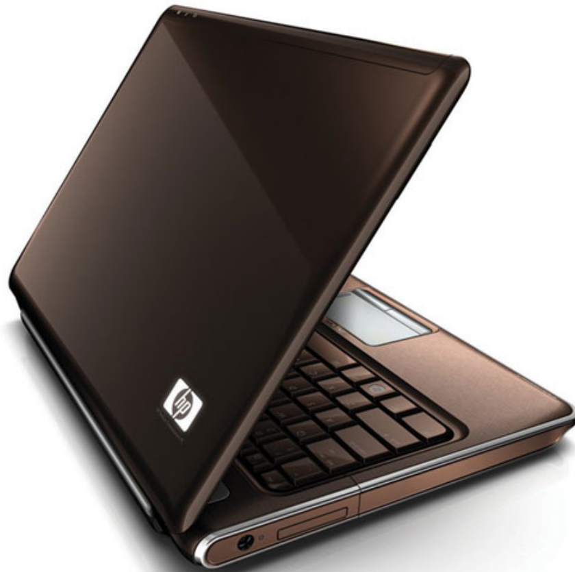
HP Paviliion dv3 with copper color cover.

HP Pavilion dv3 is a popular multimedia entertainment laptop. The 13.3-inch screen is the best size because it balances between a sufficient workspace and high mobility. These cross-range models were very successful, Apple's MacBook 13.3 inch or "brother" HP Pavilion dv3600. Both are equipped with more powerful Intel processors than AMD's Pavilion dv3. In addition, Pavilion dv3 is also equipped with large hard drive HDD 320 GB, with good battery life using the 9 cell battery.