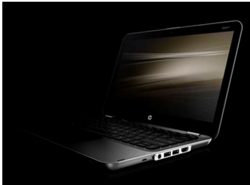
HP Envy 13.

Meanwhile, the Envy 15 is one of the thinnest and lightest 15-inch laptops. Metal etching technology on the lid and armrests bring a sense of luxury. The magnesium alloy case makes the Envy 15 light, 2.5 cm thick and weighs 2.35 kg.