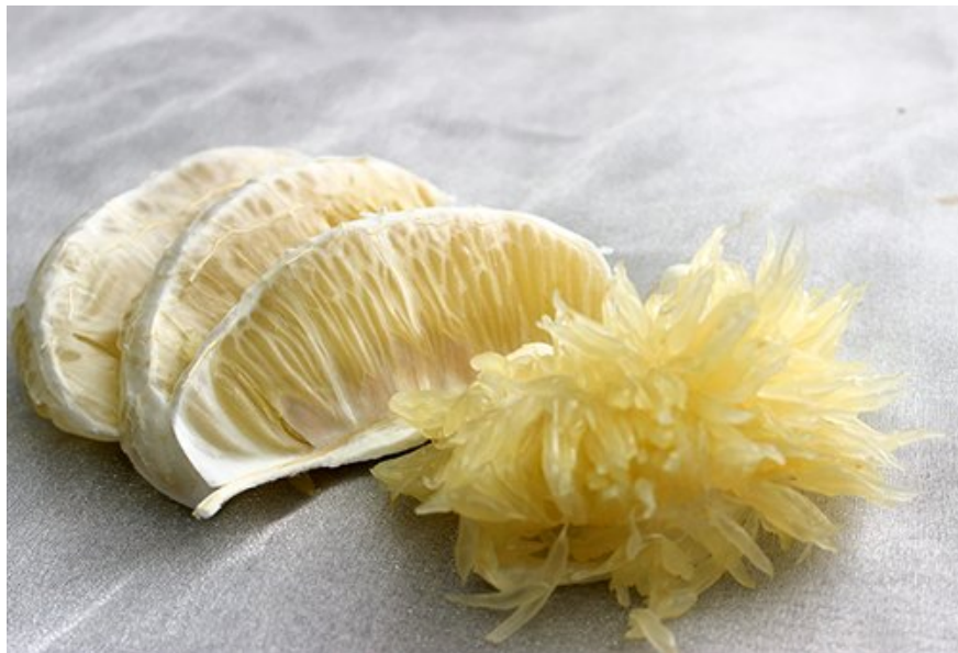
Separating grapefruit cloves to make grapefruit dog fur