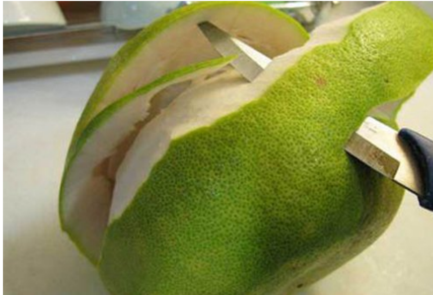
Peeling grapefruit

Peel grapefruit. Thoroughly peel off the white pulp on grapefruit intestine to facilitate separation. If you make a dog body with a grapefruit shell, it is advisable to peel it in a spiral shape so that the grapefruit peel will make it easier to shape the pomelos.