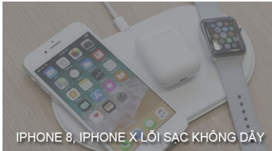
IPHONE 8, IPHONE X LỖI SẠC KHÔNG DÂY