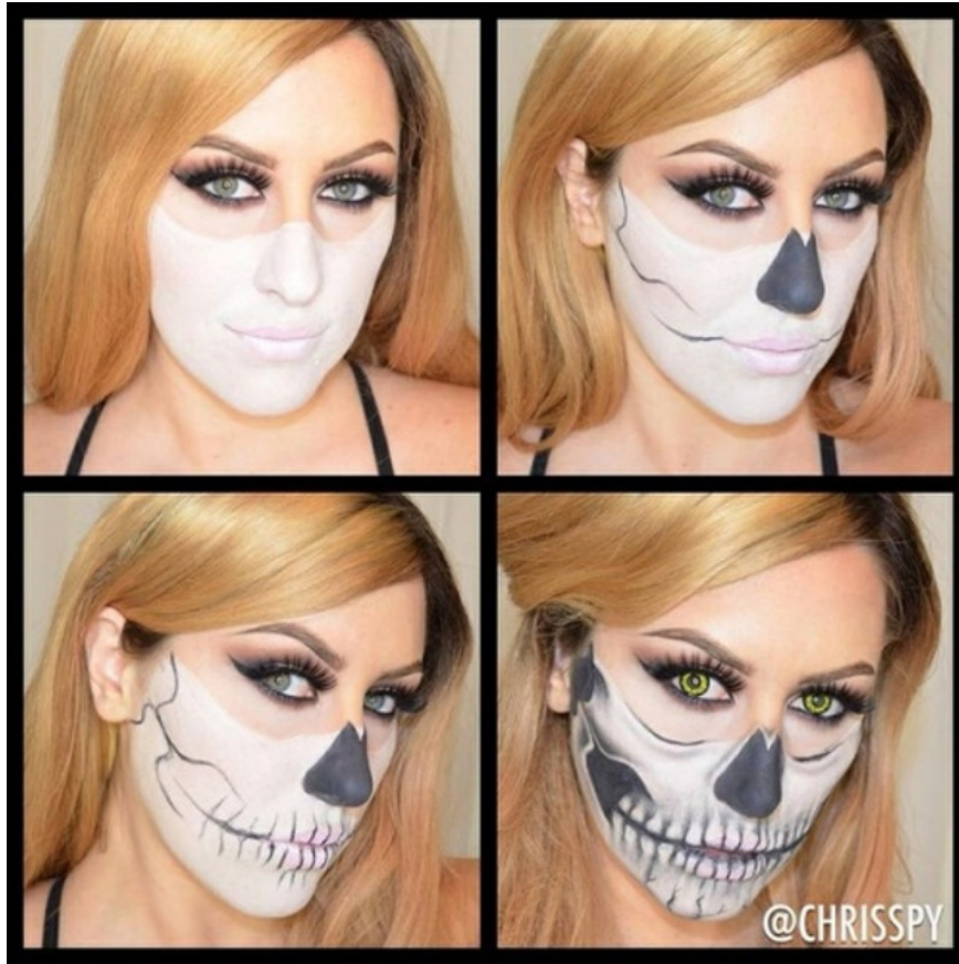
Dress up as a horror skull.