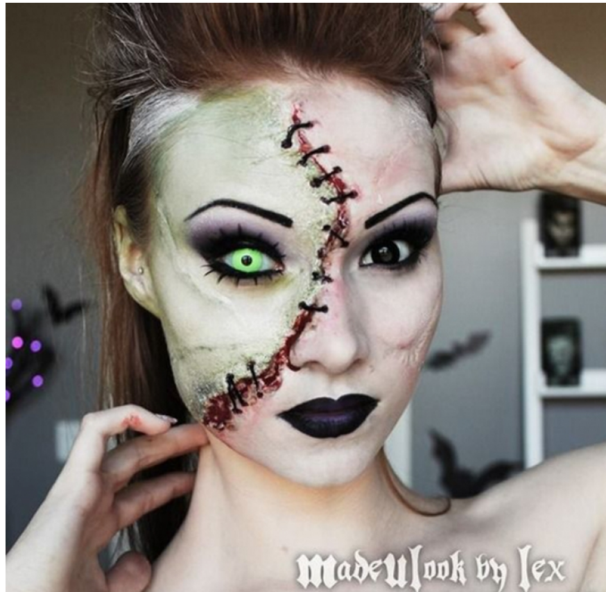
Live corpse mask.