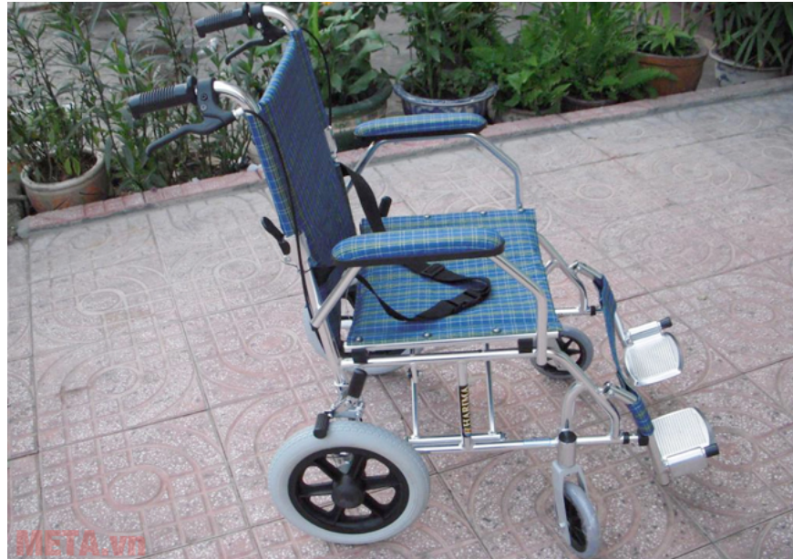
Travel wheelchair image