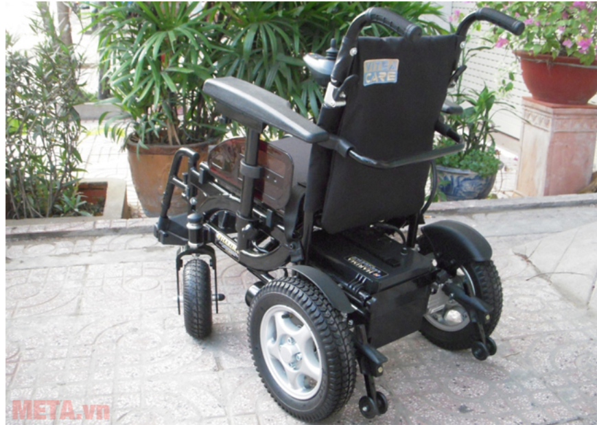
Electric wheelchair image