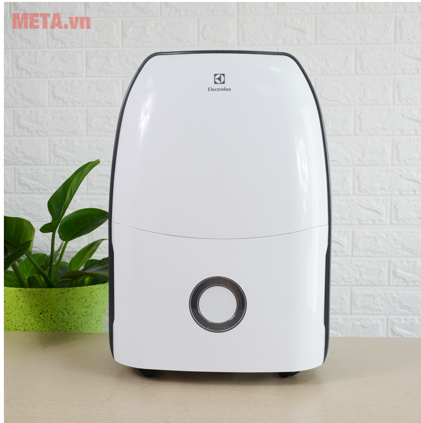
Dehumidifier Electrolux EDH12SDAW