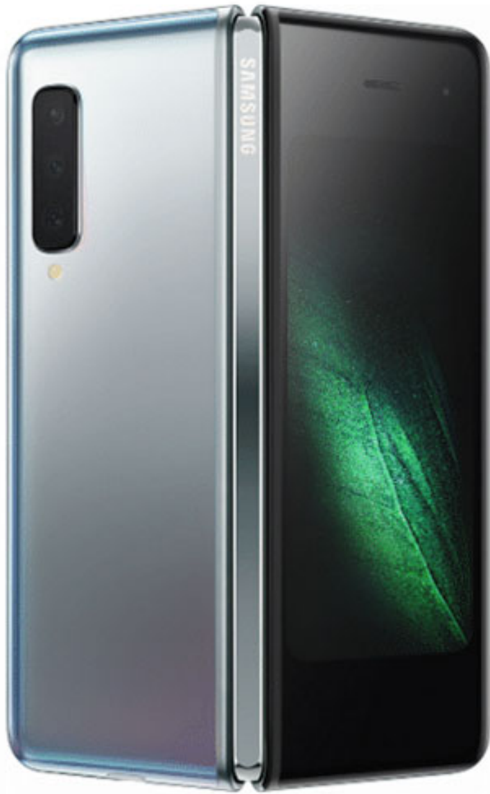
Galaxy Fold of Samsung

Samsung's Galaxy Fold - the first one-piece folding phone from a major manufacturer - suffered a hinge error. Of course, putting any kind of mechanical or moving parts into the device is likely to shorten its average lifespan.