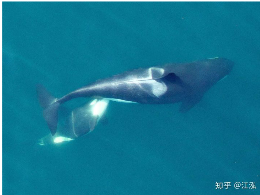
Killer whales also breastfeed in the same way.

Depending on the size of each species in the whale, the young will need a different amount of milk. In species with large bodies such as sperm whales or humpback whales, the juveniles can drink from 400 liters to more than 500 liters of milk per day.