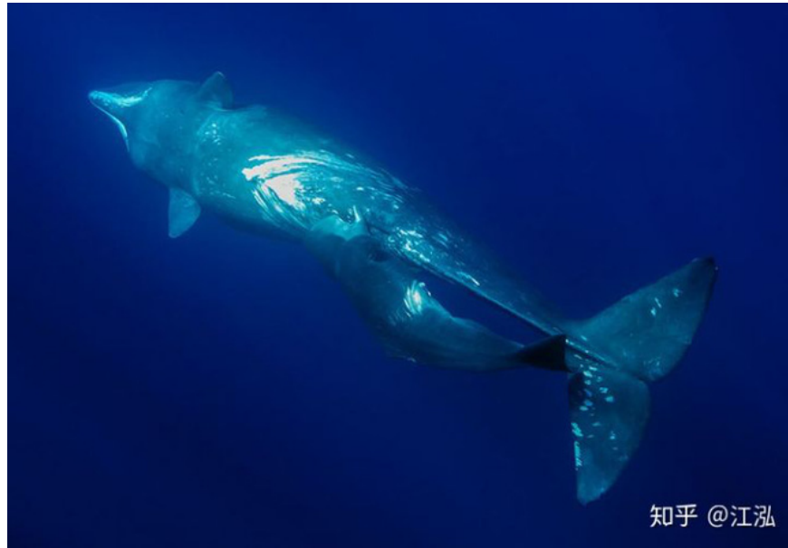
Images of sperm whales feeding mothers.