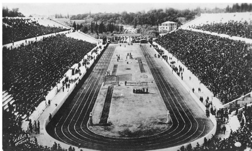
Panathenaic Stadium in the first Modern Olympics took place in 1896 - (Photo: Getty Images)

Two years later, Coubertin held a meeting with 79 delegates representing 9 countries to announce the restoration of the Olympic Games. Delegates at the meeting voted unanimously for the Olympic restoration plan and decided to set up an international committee to host the Olympics. This committee became the International Olympic Committee (Comité International Olympique), and Demetrios Vikelas, Greek delegate was elected the first president of the Olympic Committee. Aten was chosen to host the first Olympic Games, and planning began.