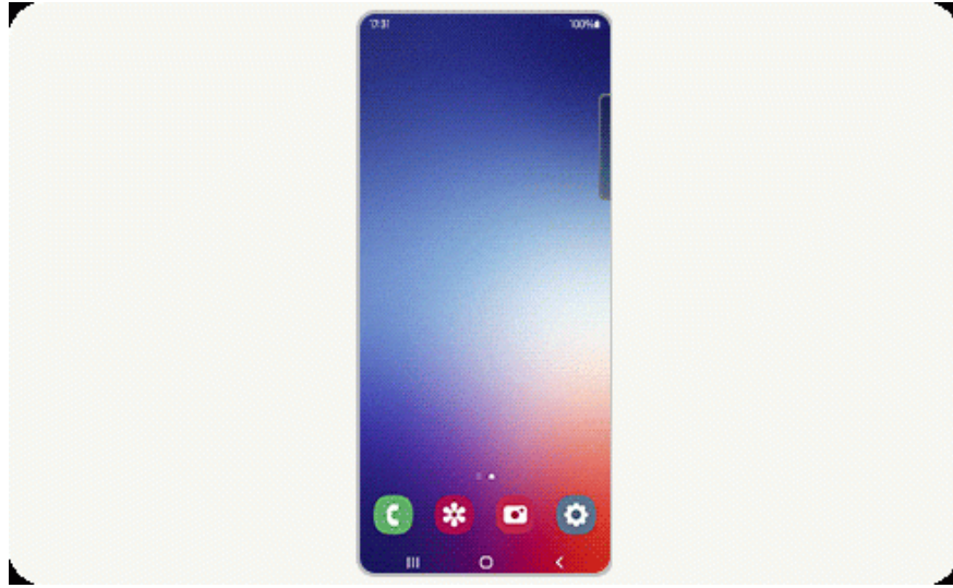
Picture 3 of Hidden features on Galaxy smartphones that many people may not know

You finished reading the article " Hidden features on Galaxy smartphones that many people may not know " edited by the TipsMake team. We hope this article has provided you with many useful tech tips and tricks. You can search for similar articles on tips and guides. Thank you for reading and for following us regularly.