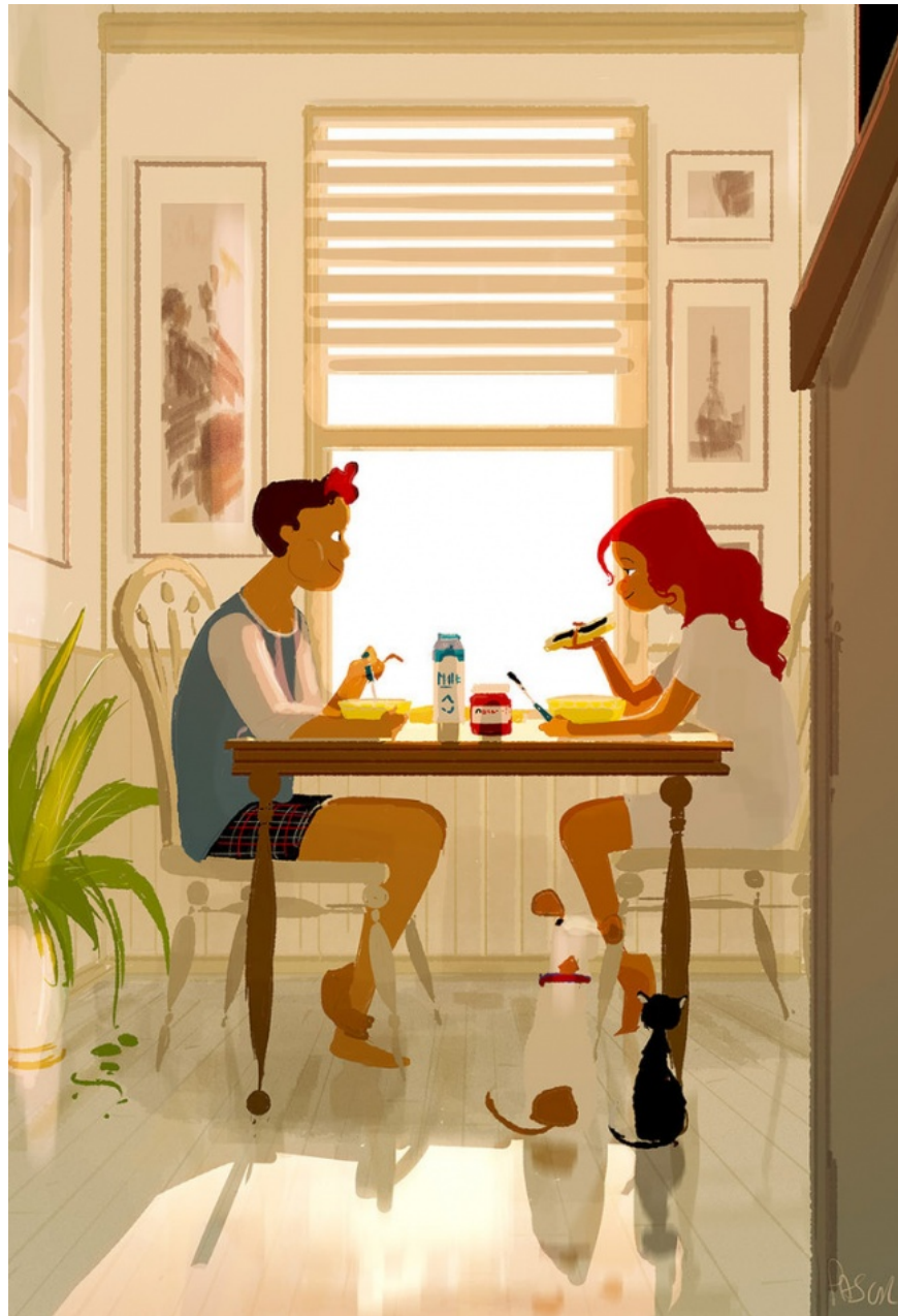
Breakfast with loved ones