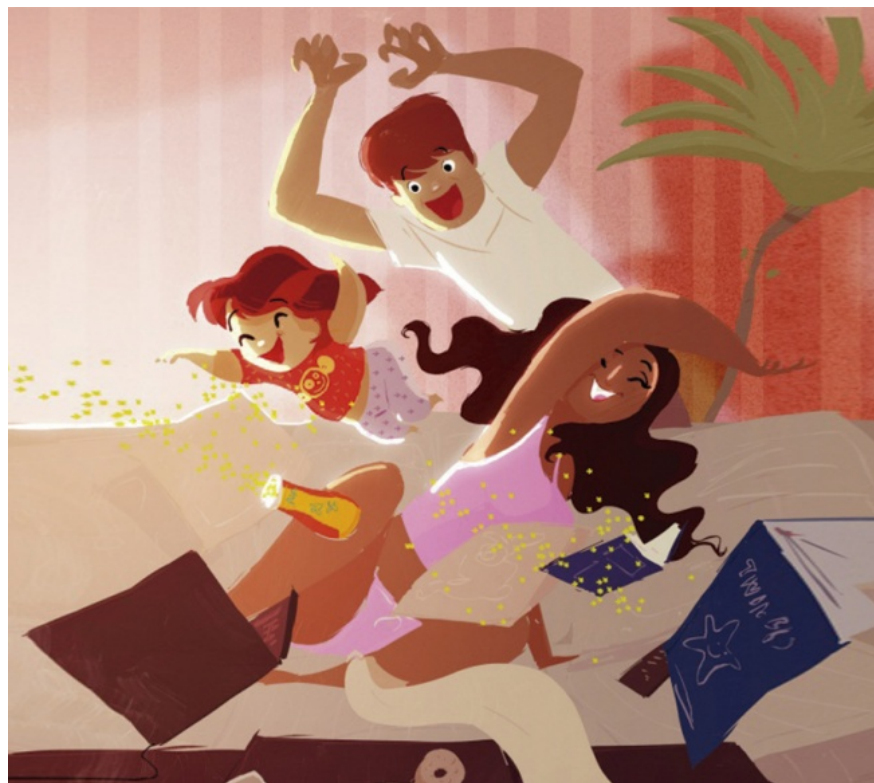
Laughing with the whole family