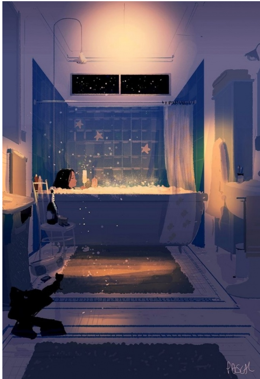
Bath and relax