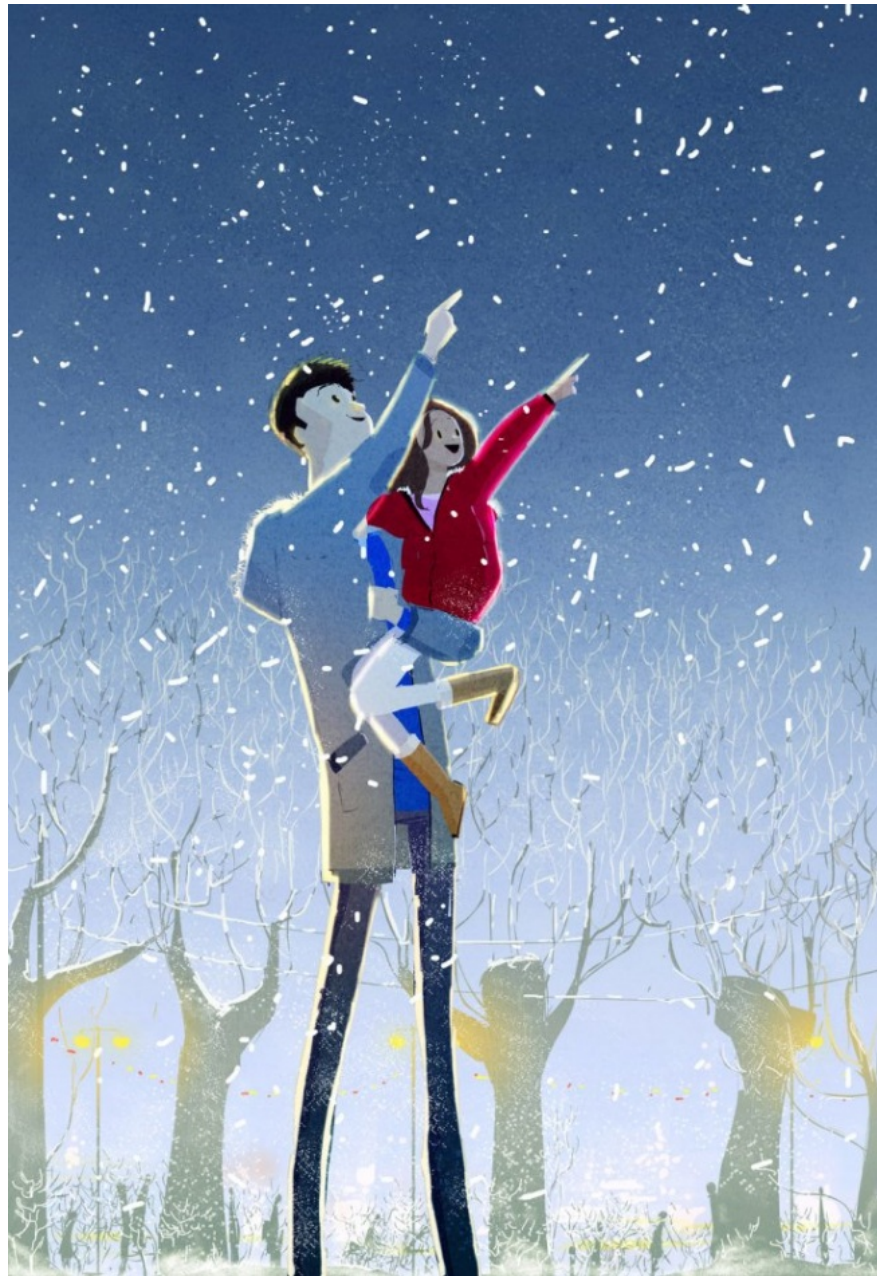
Star and desire