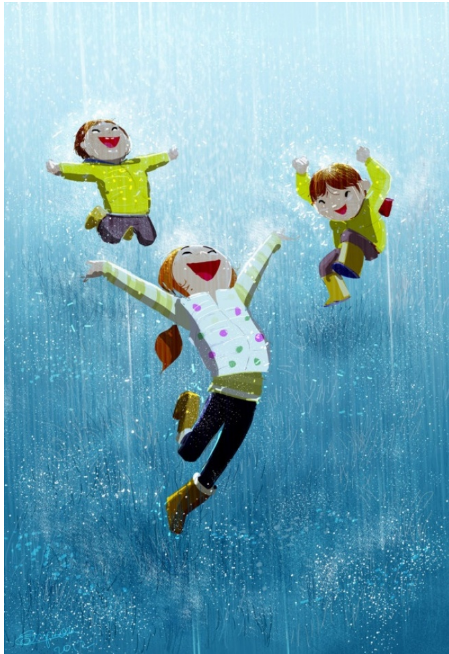
Playing in the rain