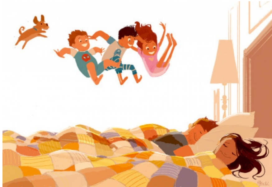
Wake up the way you like best