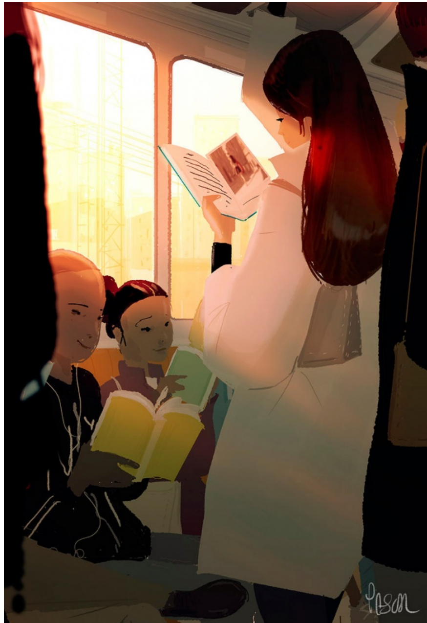
Relax by reviewing the family album