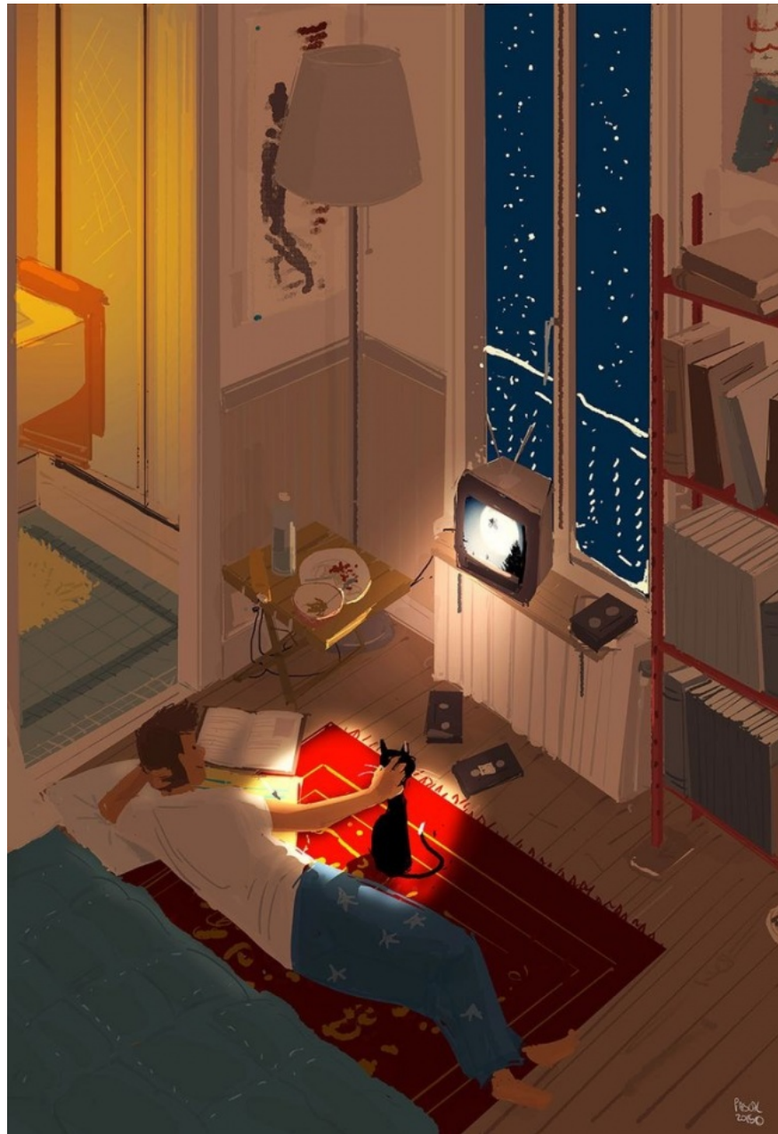
A warm evening with favorite movie