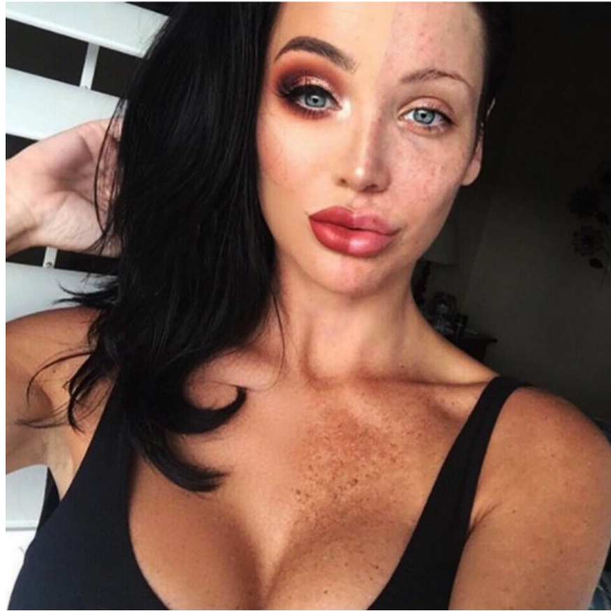
Two half faces with two completely different styles!