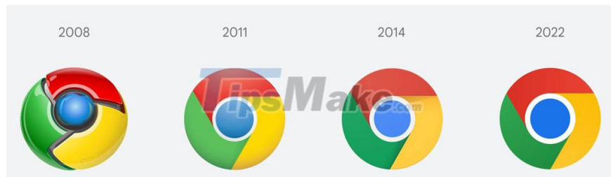
Google Chrome logo from 2008 to present.

Google has re-branded the Chrome web browser after 8 years. At first glance, Chrome's new logo seems to be no different from the old logo with a circular design with 4 distinctive colors that appeared from the 2008 logo version.