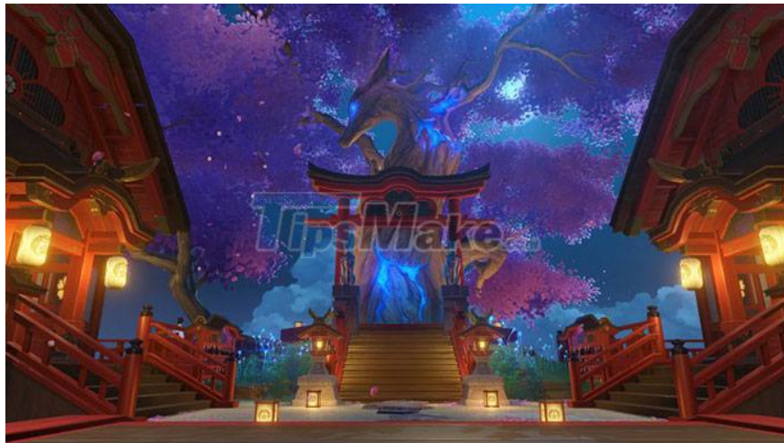
Magic Sakura tree at the back of Grand Narukami Shrine, Inazuma

This is a large Sakura tree behind Grand Narukami Shrine, Inazuma. It creates Sakura Blooms for Electro characters to collect using their elemental skills. Sakura Blooms are also an important ingredient for many dishes in Inazuma.