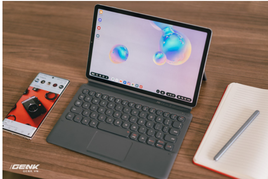
Samsung Galaxy Tab S6

Leaked renderings show that the Galaxy Tab S6 Lite will look identical to the standard Tab S6. In particular, this tablet also comes with the redesigned S-Pen, which is thicker than the Galaxy Note series pen and cannot "fit" into the body. Because of this, the Tab S6 Lite will be able to wirelessly charge the S-Pen.