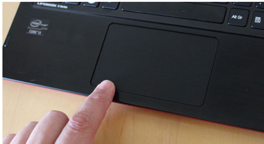
The mouse hoverboard is hidden with two extra keys.